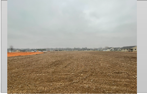
Baseball outfield dragged, seeded and fertilized