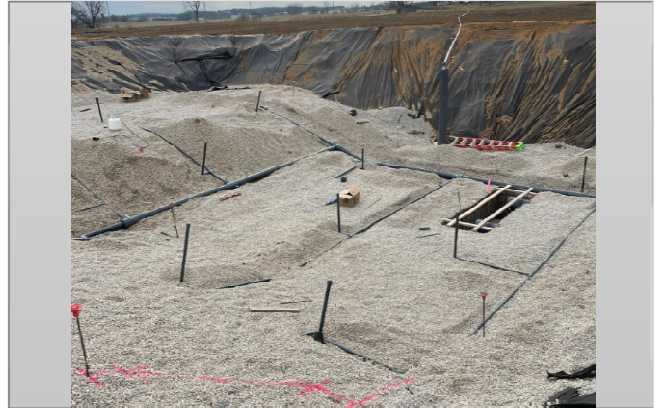
Pipes continuing to be installed in lap pool bottom