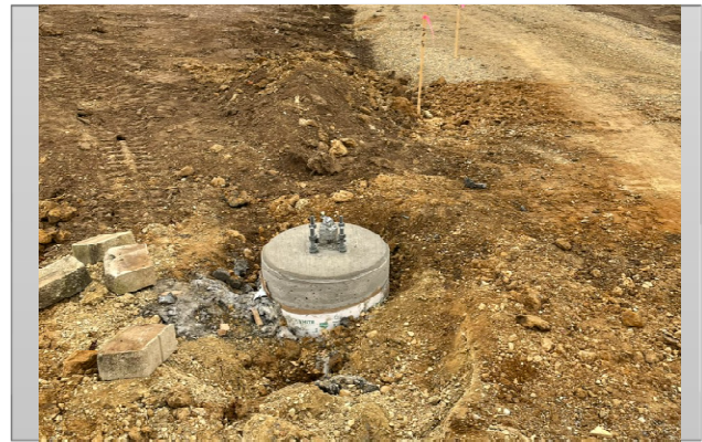
Light pole base pipe rough in completed and base poured on East side of site