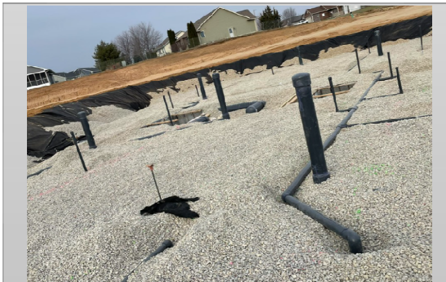
Lazy river portion of pool pipes being installed