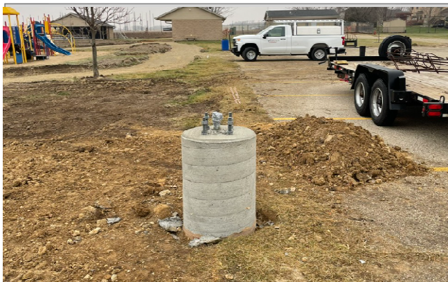
Light pole base poured on East side of site by existing parking lot